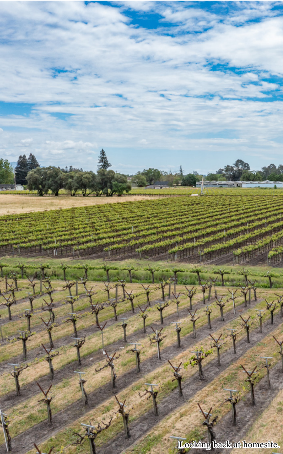
Looking back at homesite.